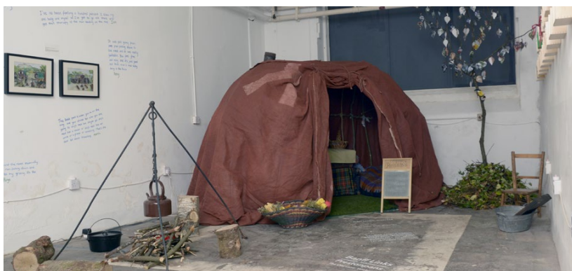
The Time Travellers installation gave the audience a lot to think about

USUALLY a newspaper headline like the one above is followed by a negative article, but not this one! Over 50 Gypsy/Travellers contributed towards an exciting installation at the Summerhall arts venue in October, as part of the Scottish Mental Health Arts and Film Festival (SMHAFF).