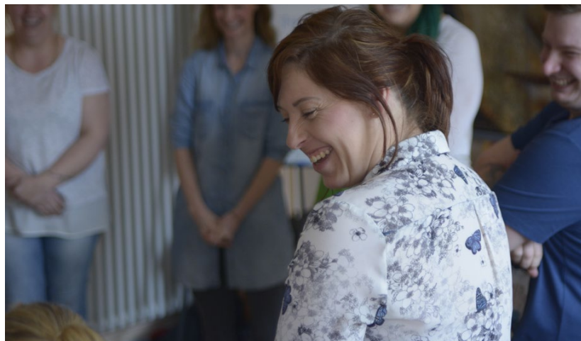
Student Nurses from the University of Dundee enjoying the performance and learning about the issues

OR ARE we going for Golden Globes this year? Yes, we had a few Oscar-winning performances last spring at the Forum Theatre workshops we held near Perth – and we have video evidence to prove it!!!